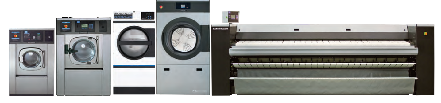
On-Premise, Central Laundry Washers, Dryers, Feeders, Ironers, Folders, Stackers Enjoy a central laundry perfectly sized to meet your property's production and quality goals.

We offer three distinctly different laundry equipment solutions for hotels and resorts: