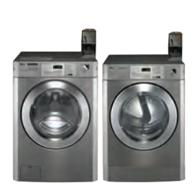
Guest Laundry Vended Washers & Dryers Provide a high-quality guest experience with industry-proven guest laundry solutions that look as good as they perform.