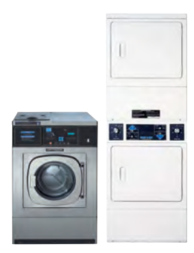
Valet Laundry & Workwear Washers, Dryers & Ironers Handle guest laundry in-house with the ultimate valet laundry solution.